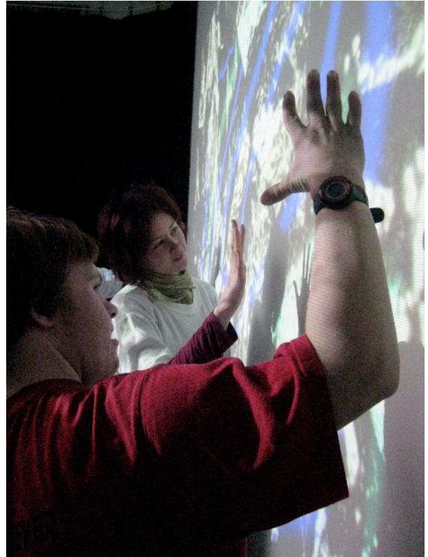
Catching Images II