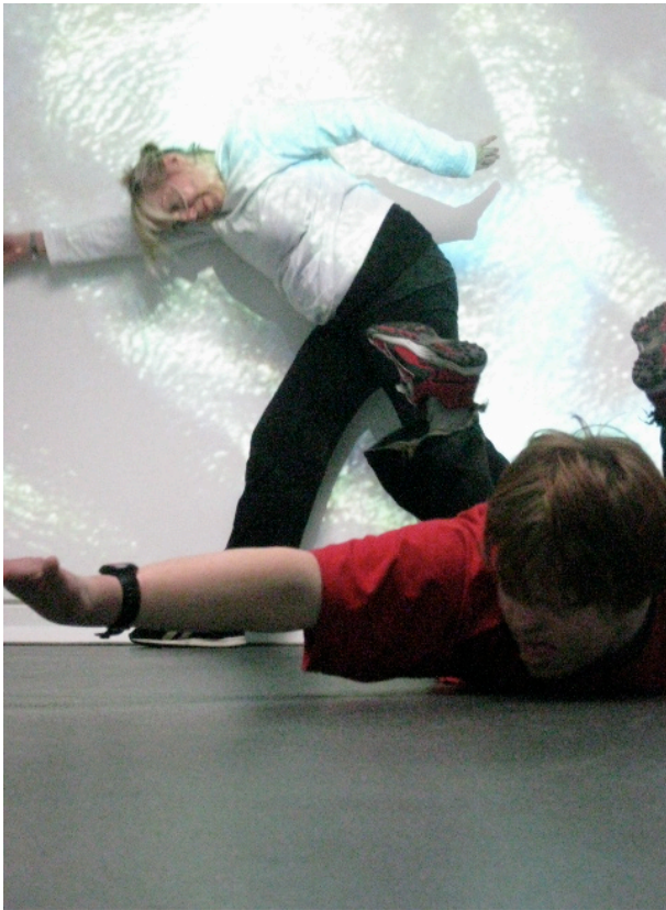
Lines of Movement I

Immersed in Water is an immersive video and sound installation on all four walls, with a collage of digitally produced images created by the media project at the Level Centre. Here you see some people noticing and catching the images, and others using the installation for creating improvised movement.