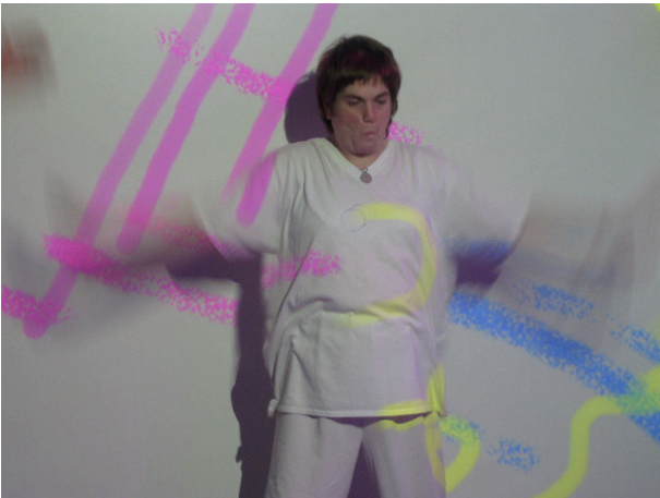
Drawn In II

Each year Spiral, the First Movement performance company, contribute to a local Arts Festival in Wirksworth. In 2009 the public were invited to come aboard the Level Mobile Studio and watch a live art performance of projected drawing, sound and expressive movement.