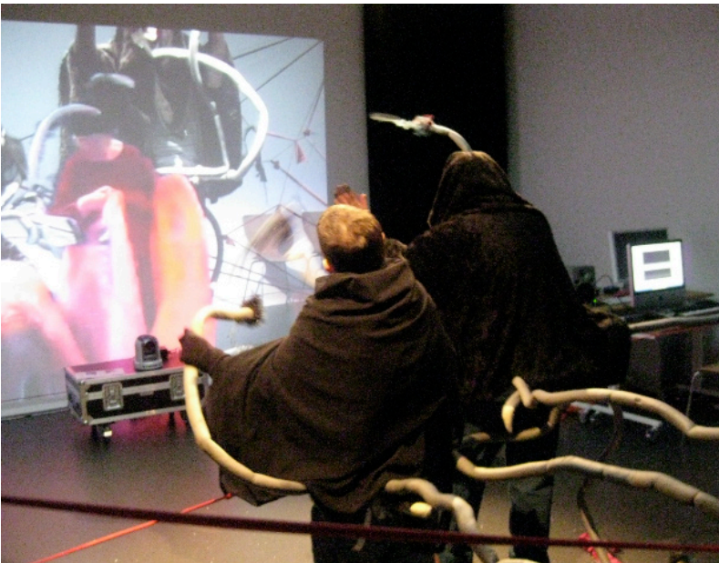
Live Event Link II