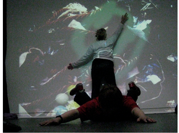
Lines of Movement II