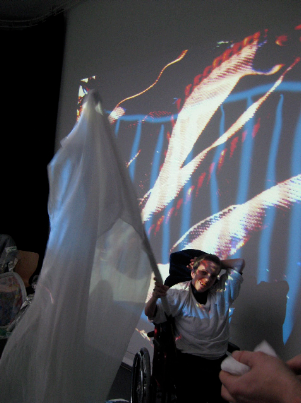
Catching Images I

Both of these image and the four following show different ways of interacting with the video and sound installation 'Immersed in Water'.