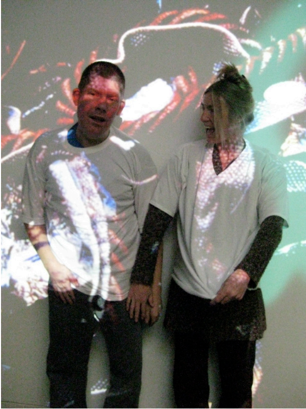
Immersed in Water