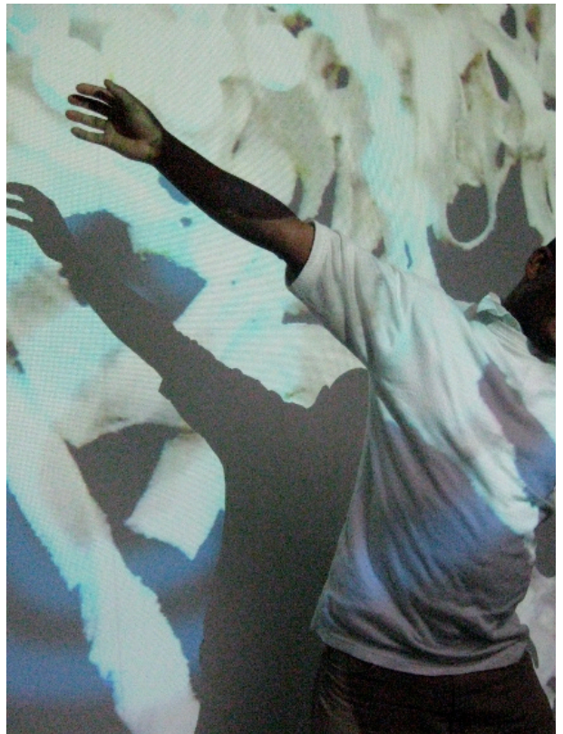
Lines of Movement III