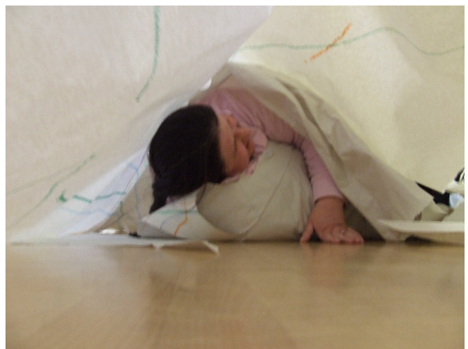
Draw and Move II