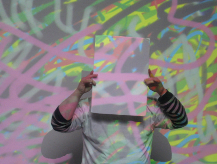
Catch the Light I

A playful interchange between artist and catcher. As one person uses a drawing tablet to graffiti the wall others try to track and catch the moving lines of colour.