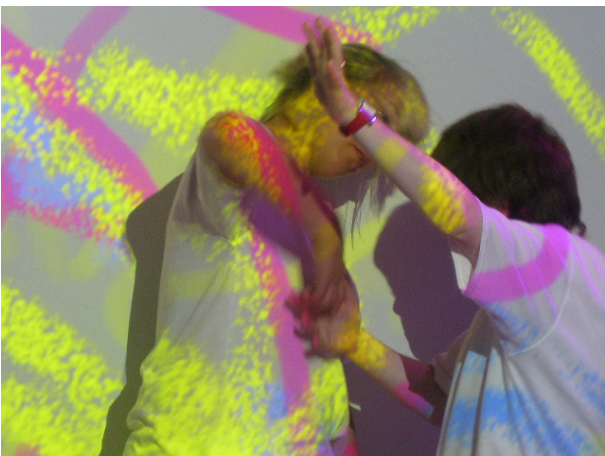
Drawn In III