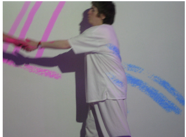
Drawn In I