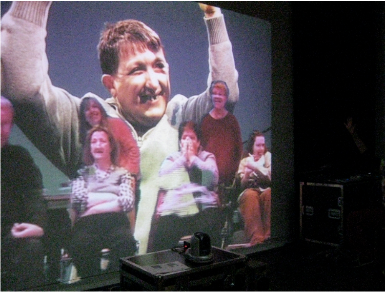
Live Event Link I

Using the live video link, people in rural Derbyshire and rural Leicestershire meet in the same picture and create dramas using the large projection screen.