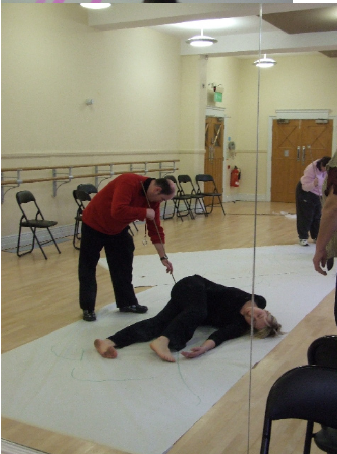
Draw and Move I

Regular First Movement sessions take place in the dance studio at Deda in Derby. Here the artist etched lines around the dancer but in the end the dancer became cocooned in the drawing.